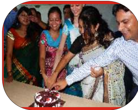
Yeppiee !! its celebration time....