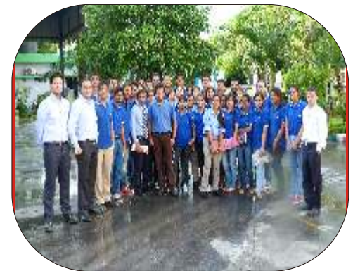
Industrial Vist in MICRA.