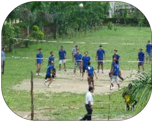
Its time to Playyyy...