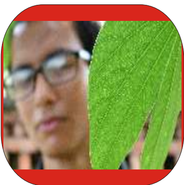
Its time to improve Photography Skills